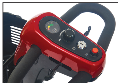
1. An Infinite Adjustable Tiller (no knuckle) at your fingertips!

Literature is current at time of printing. Golden Technologies reserves the right to make changes to the product or literature at any time.