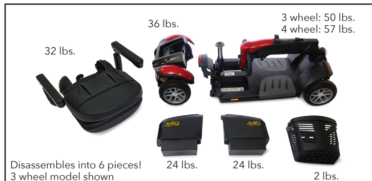
Disassembles into 6 pieces! 3 wheel model shown