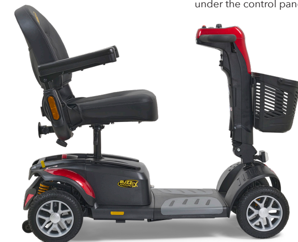
5. A stylish new profile offers ample leg room!