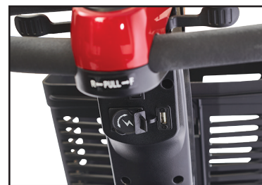
4. USB & Battery Charging Ports conveniently located on the tiller under the control panel.