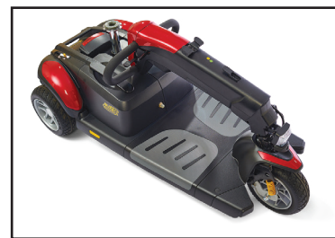
2. The tiller folds easily and locks in place.