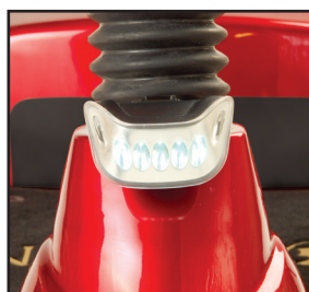
Front and rear lights and side reflectors for safety