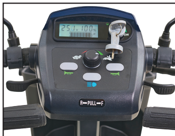
Digital Dashboard & User-friendly auto-tiller adjustment