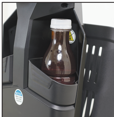
Conveniently located drink holders