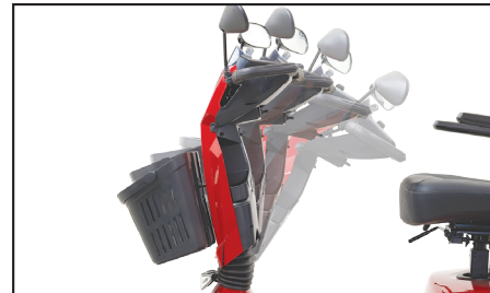
Infinite adjustable tiller with ergonomic design