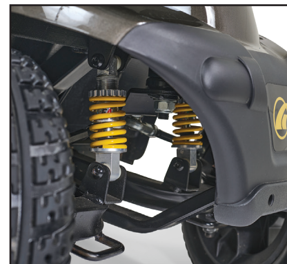
Front and rear suspension for a smooth ride