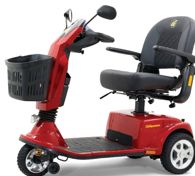
Shown with Power Elevating Seat