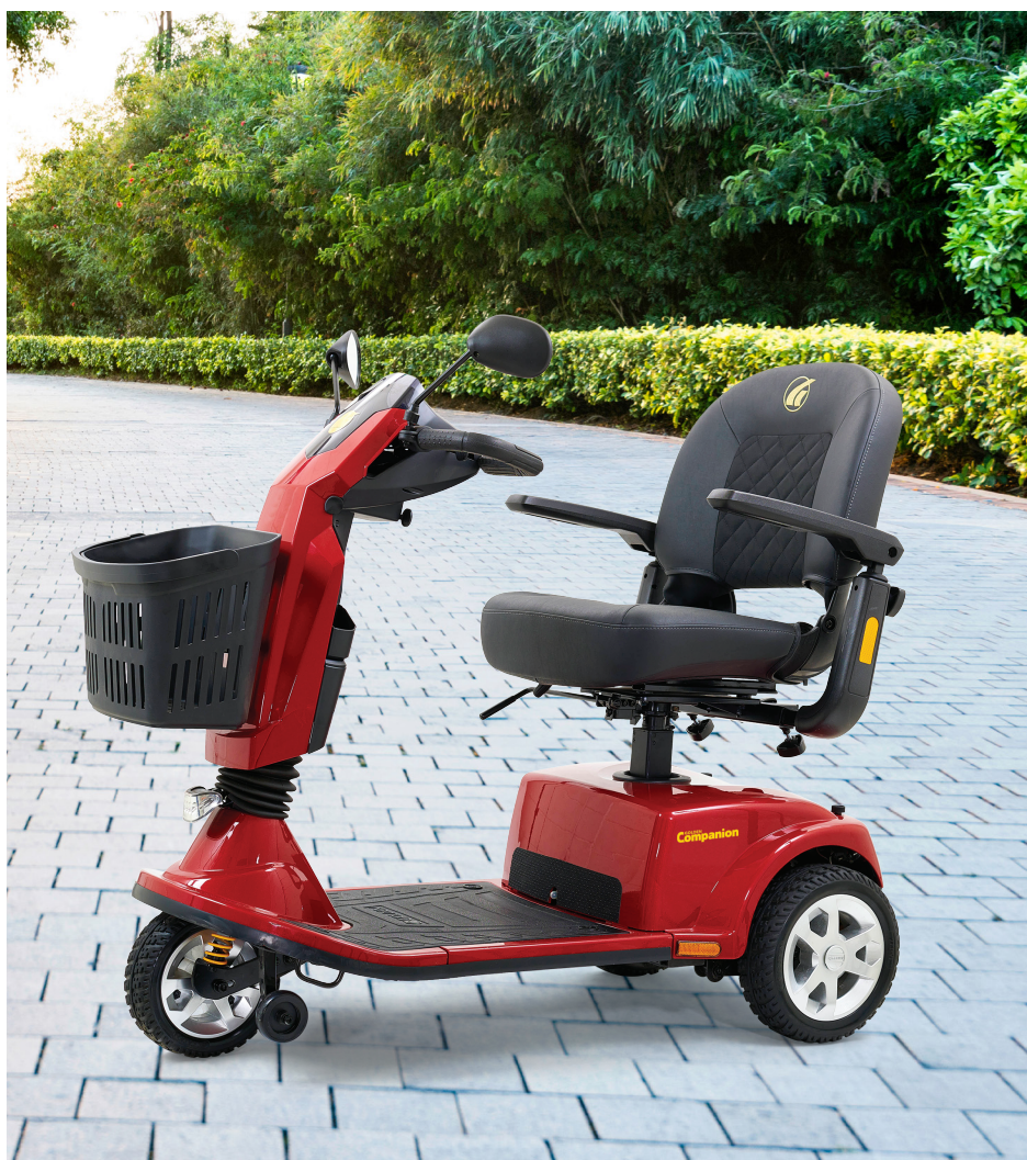
Shown with Power Elevating Seat