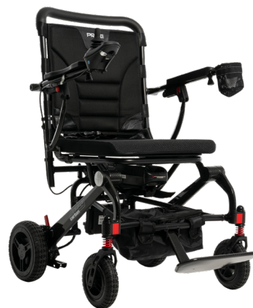
FDA Class II Medical Device 1